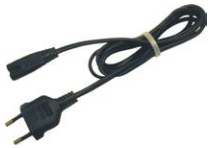
Mains cable 230 V with IEC C7 plug