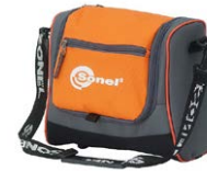
M-6 carrying case