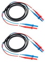
Double-wire test lead 3 m (10 / 25 A) CAT IV 1000 V